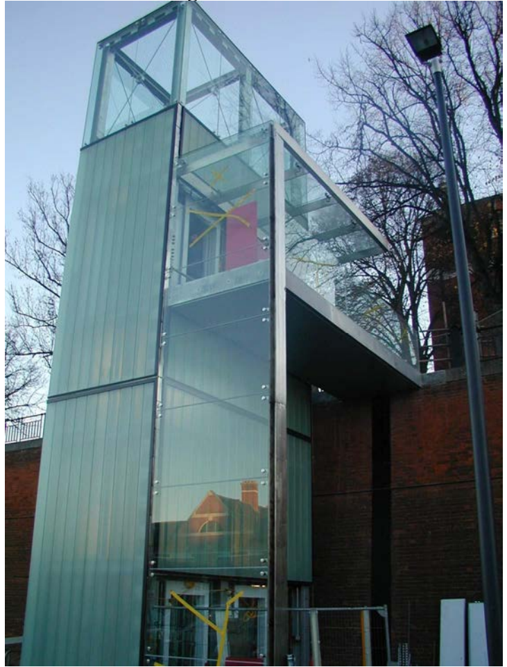
Circulation building exterior