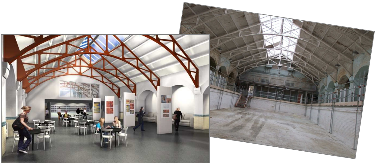
Architect's image - interior design option

Fitted out with a café bar, AV/IT sound system and flexible performance/events space, the Student Hub will be the flagship venue on campus for informal socialising and dining, societies, entertainment and nightlife.